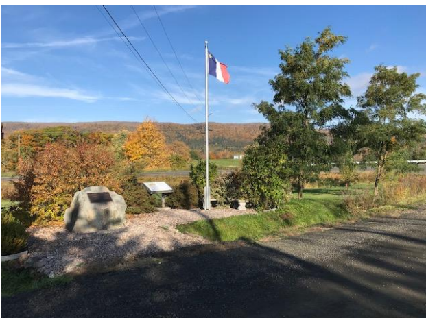
Automne / Fall 2021

We need help! Please note the ditch in front of our monument. We need to install a culvert and a cover in order to protect tourists and our devoted volunteers. The panel is starting to show some wear and tear...needs repairs. If you can help, please visit our donation button on our website noted below. LeBlanc Association of Nova Scotia | Facebook www.monumentleblanc.com