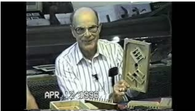
Our Town Erath – Local Artisans Discuss their Craft (from 1999) https://youtu.be/ypSwQtpqCKM

Please stay tuned! And while you're waiting, enjoy this little jewel from the collection.