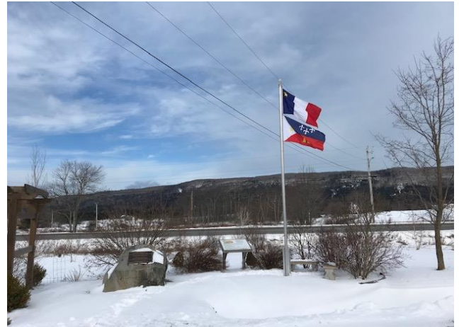
Hiver / Winter 2021-2022