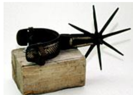
Item from our collection at the Acadian Museum