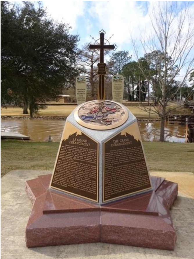
The Acadian Odyssey Monument