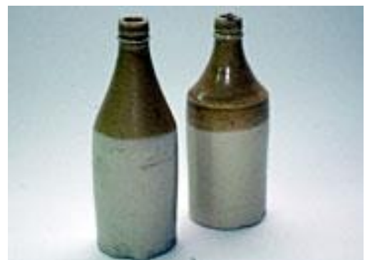
Items from the museum collection