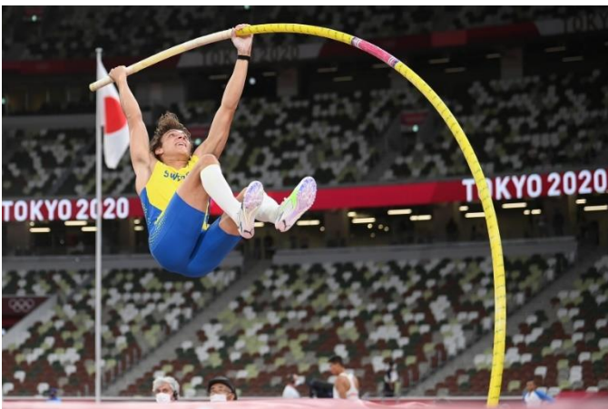
Armand Duplantis of Team Sweden competes in the Men's Pole Vault Final on Day 11 of the Tokyo 2020 Olympic Games

This article by Bjorn Morfin appeared on KLFY.com: